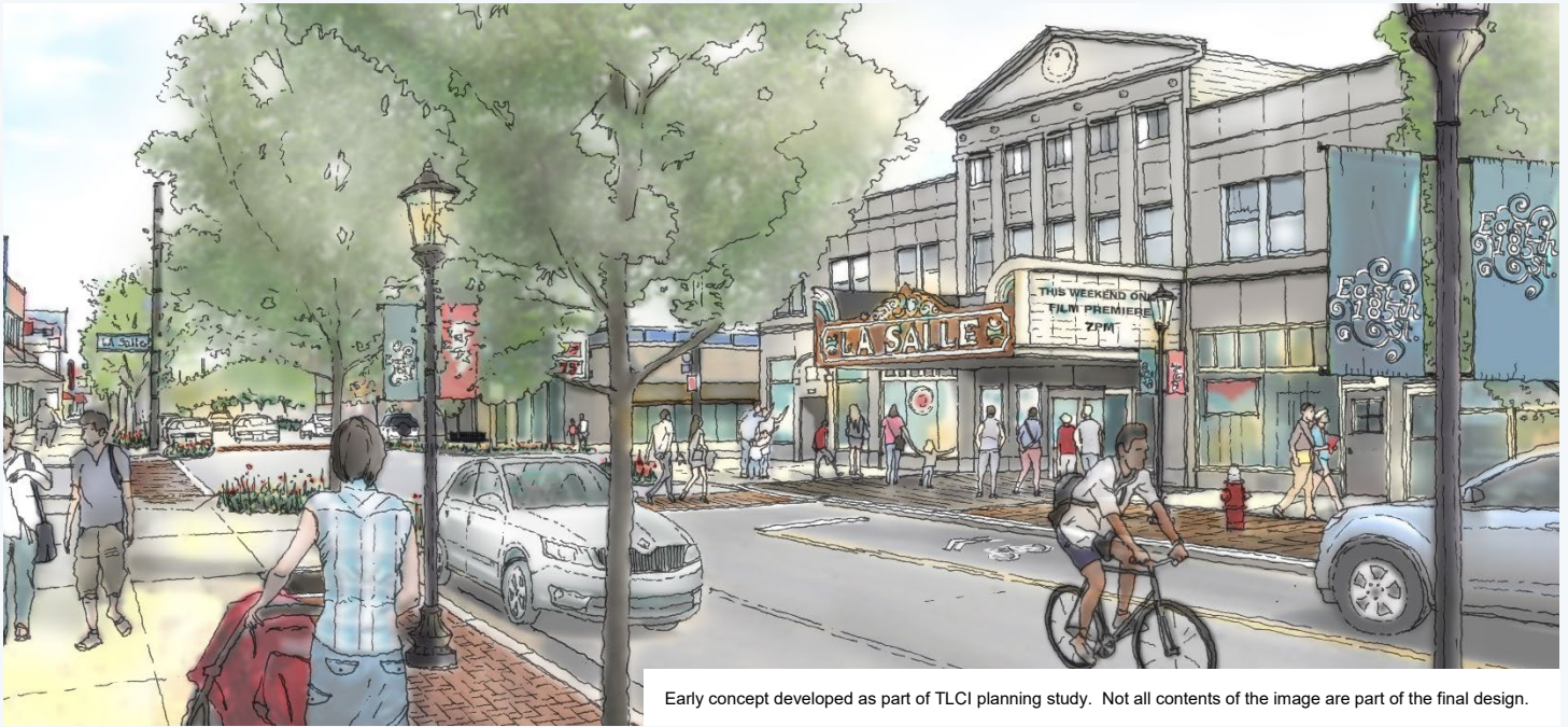
Early concept developed as part of TLCI planning study. Not all contents of the image are part of the final design.